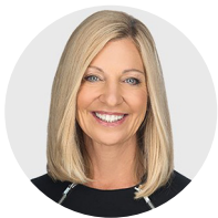
Karen Lynch President and CEO CVS Health