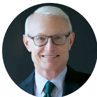
Michael Porter Professor and Director Institute for Strategy & Competitiveness at Harvard Business School